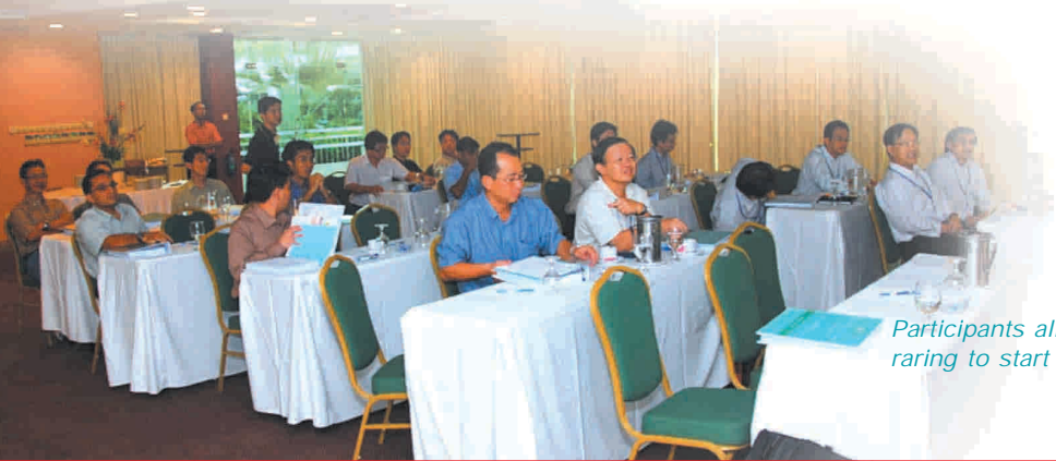
Participants all raring to start

Summing up – the training courses were a success. For those who missed out this time, please register quickly when they return. They will be better.