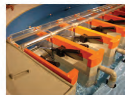
Gallery 4 -- Model showing how the crest gates work to control flooding