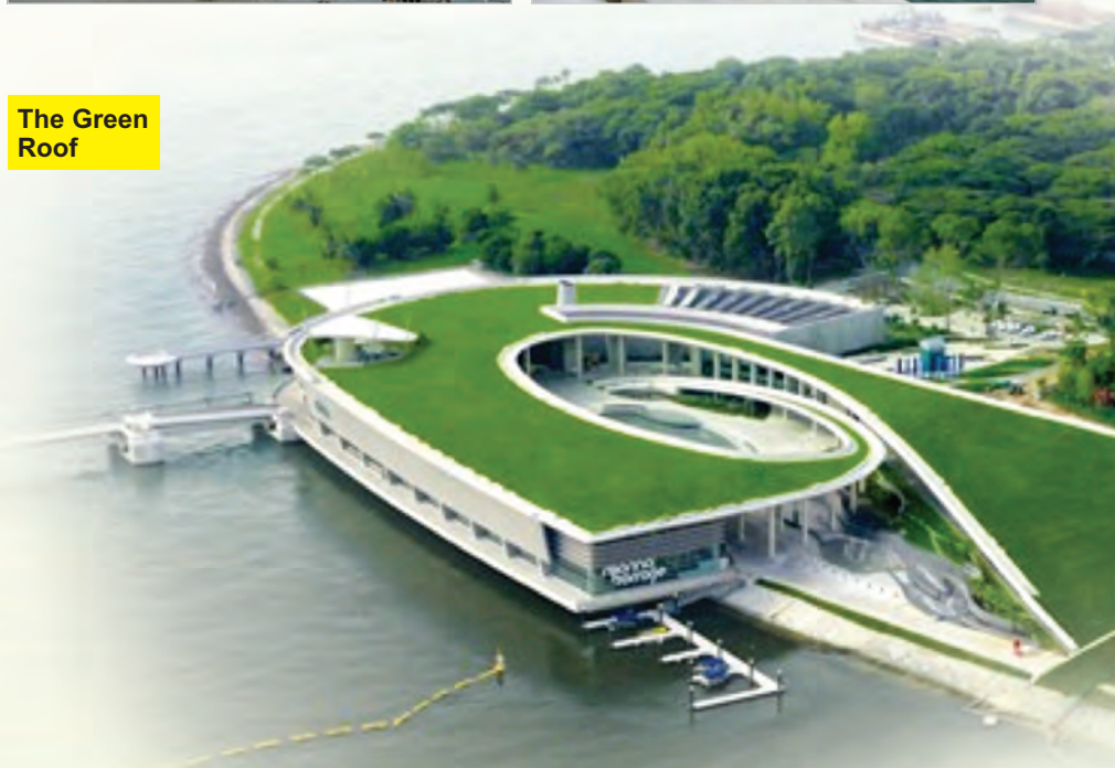
The Green Roof