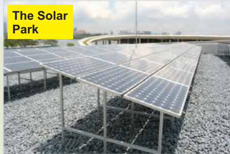
The Solar Park