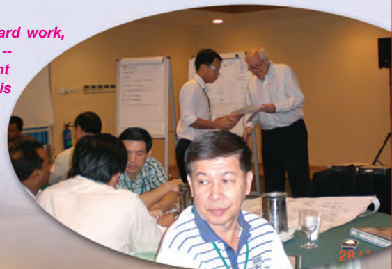
After the hard work, the reward -- a participant receiving his certificate