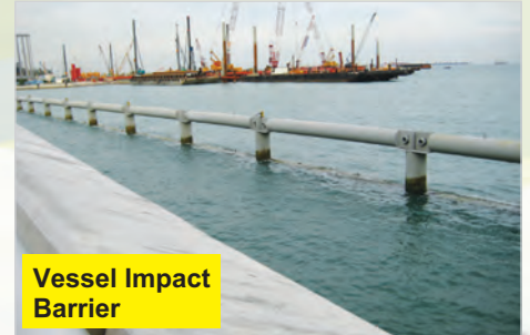
Vessel Impact Barrier