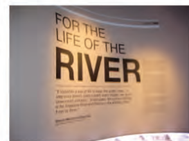
Gallery 2 -- History of Singapore River