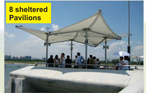
8 sheltered Pavilions