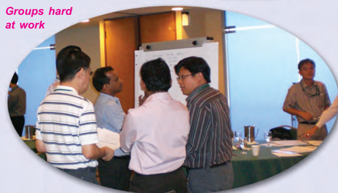
Groups hard at work