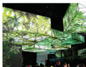
Gallery 3 -- Active Beautiful and Clean Singapore