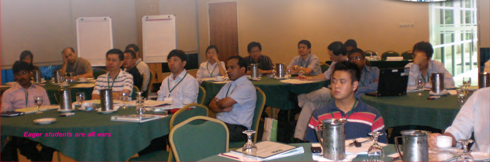
Eager students are all ears