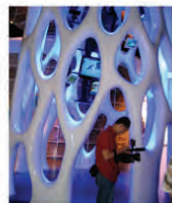
Gallery 1 -- Organic Tree -- Environmental challenges and our world