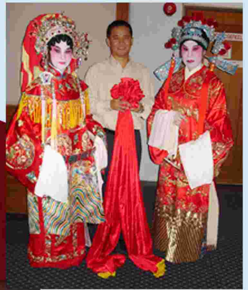
Below picture: SLP members and guests enjoying Chinese opera